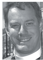
The Rt. Rev. E.J. Malcolm

The Rt. Rev. E.J. Malcolm (Presiding Bishop, Church of England (Continuing) Minister, St. Mary's Episcopal Chapel, Reading)